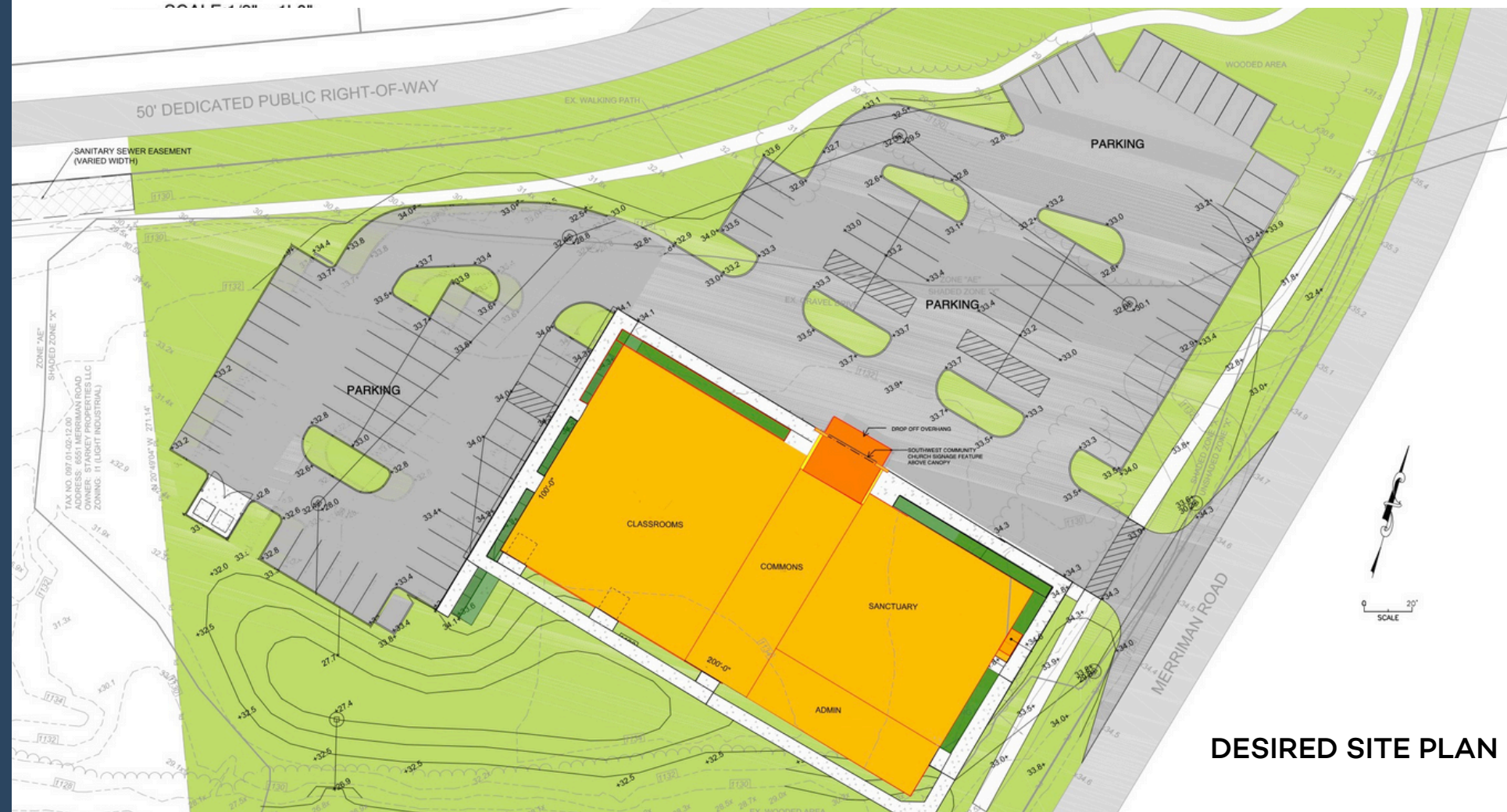
DESIRED SITE PLAN